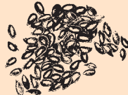
British Grown Linseed