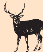
Red & Fallow Venison