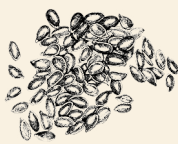
British Grown Linseed