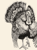
Norfolk Black Turkey