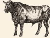
Aberdeen Angus Beef